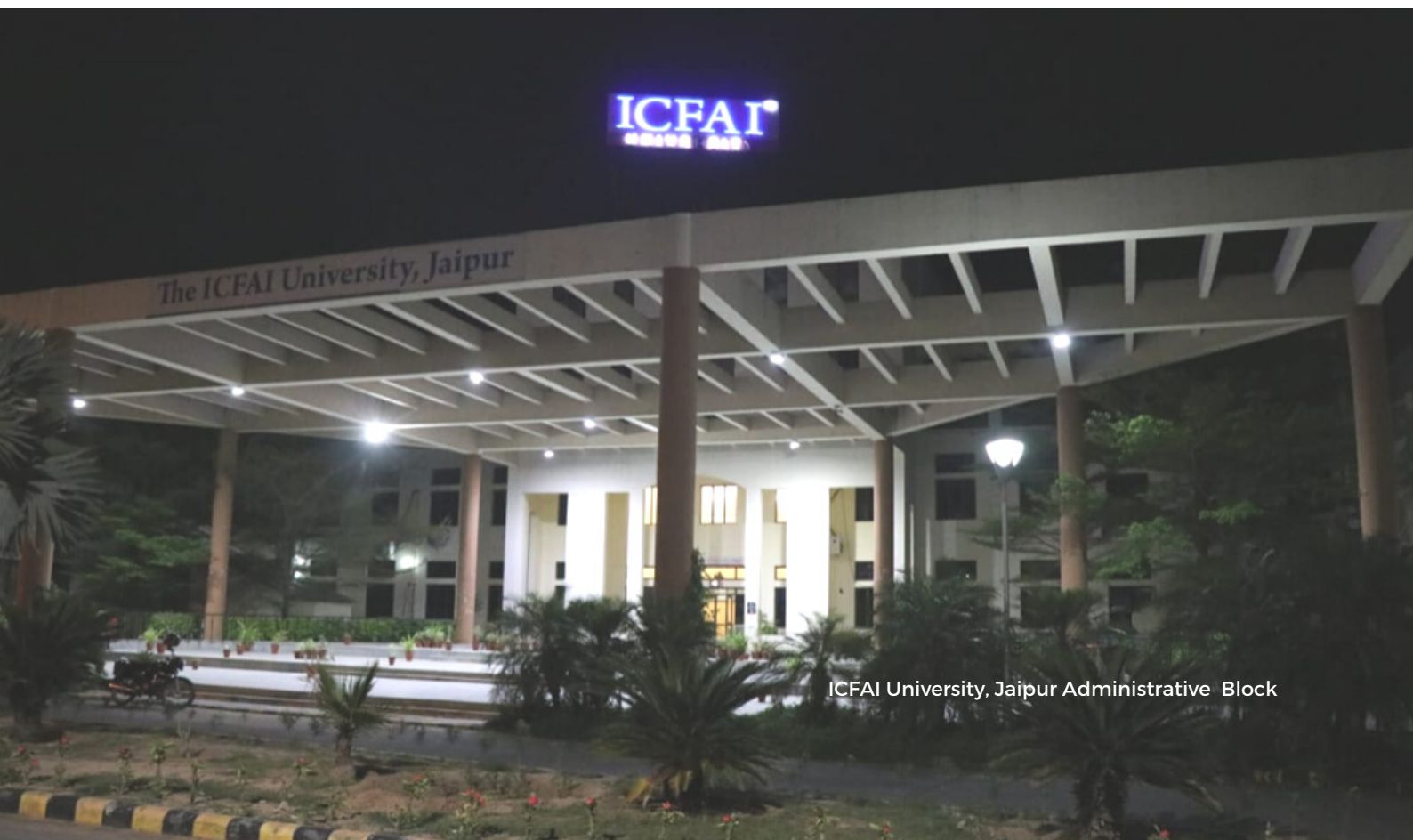
ICFAI University, Jaipur Administrative Block