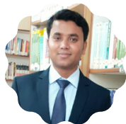
SAIFUDDIN AU Bank