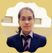
ETI MANGAL Asahi Glassl