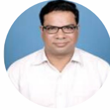
DR. HARSH VARDHAN