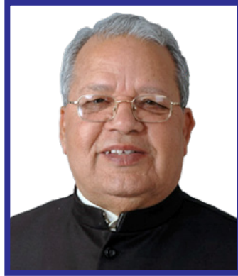
His Excellency Shri. Kalraj Mishra Governor of Rajasthan