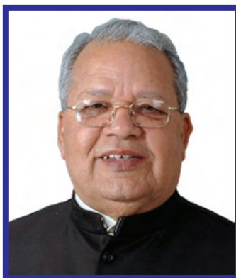
His Excellency Shri. Kalraj Mishra Governor of Rajasthan