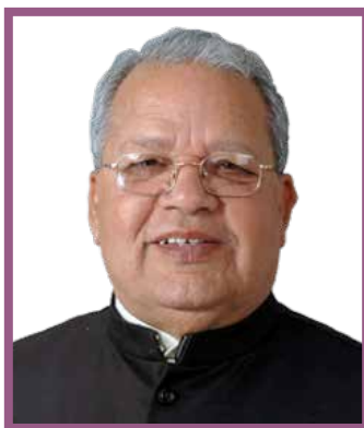
His Excellency Shri. Kalraj Mishra Governor of Rajasthan